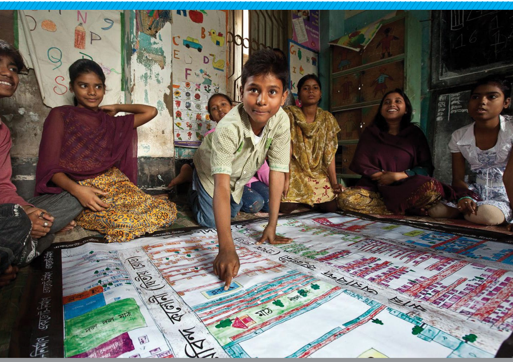
March 2015 • Child Rights & Social Accountability • Working Paper • UNICEF Human Rights Unit, Programme Division

With special attention to social accountability and its potential to achieve results and equity for children