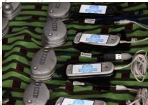
Left, smartphones are plugged in and synchronized locally, allowing researchers to analyze data on the ground.